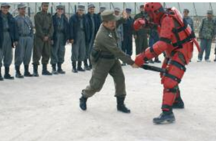
Police training, Mazar-e Sharif regional training center in January 2007.

The regional chief, a two-star Afghan police general, was a promising subject for mentoring, in the advisor's view: "He was a career police officer, very professional, and literate in Dari." But the staffing structure in place was highly inefficient by U.S. standards. For example, three to five people would be responsible for one area of logistics: "one