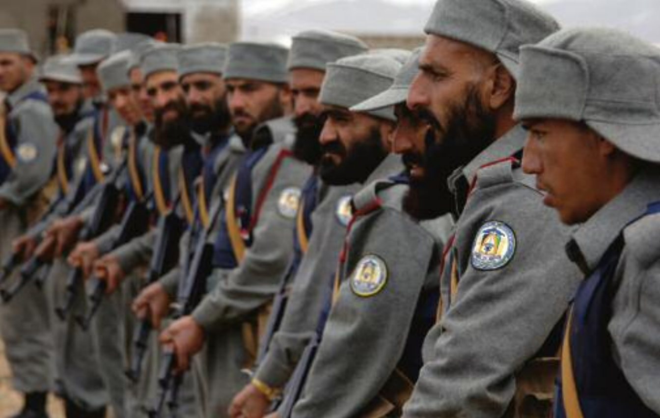
ANP recruits stand in formation near Gardez in March 2007.

We would let them select the people who received weapons. We would record the serial numbers and made it clear that if any weapons ended up in insurgent hands, or if my men took any fire from them, they'd suffer serious consequences. We told them we'd be back to check on them. This threat was meant to keep them honest.