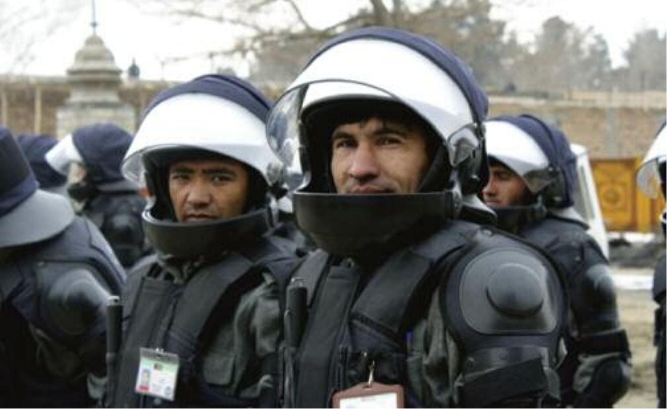
Members of the Afghan National Civil Order Police.

crowd control. 34 Unlike the ANP—most of whom were illiterate—prospective ANCOP officers were required to possess basic literacy and numeracy skills.