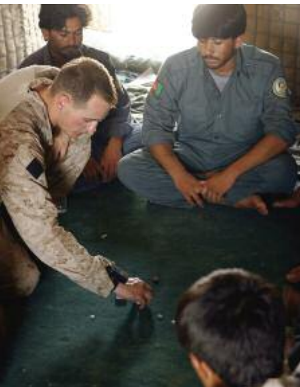
A Marine police mentor conducts a class on search operations in Garmsir District, August 2009.

Moreover, the force was plagued by the other usual ills working against police professionalism and effectiveness in Afghanistan: physical disabilities, drug use, poor morale, and widespread corruption. Rather than providing law and order to the residents of Garmsir, the ANP in the district served as sources of insecurity.