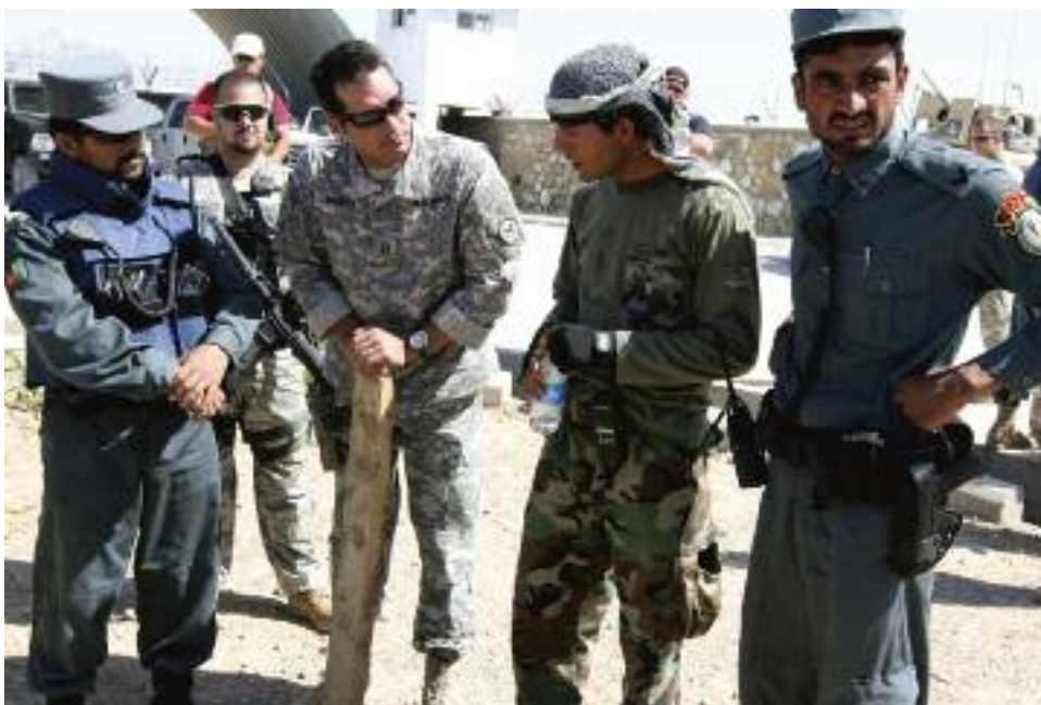
The National Guardsmen found that the police were better taught through practical exercises and instruction, and patrolling under the mentors' guidance.