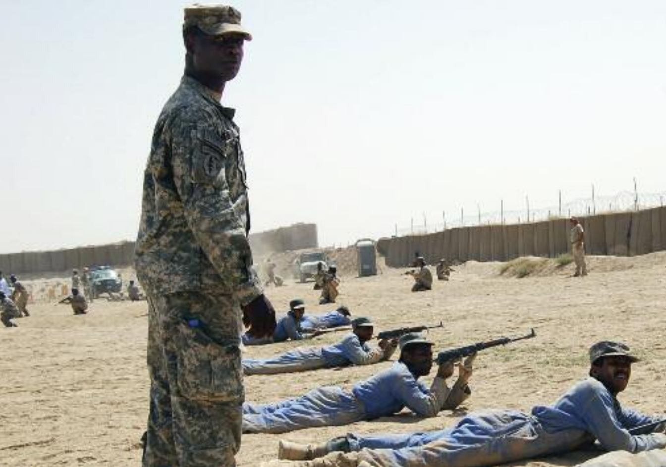
A U.S. Army mentor oversees Afghan policemen at the Kandahar regional training center.

Training at the RTC stressed combat and survival skills, including mounted patrols, movement to contact, fire and maneuver, and improvised explosive device (IED) awareness. In the sergeant's judgment, the training's heavily military orientation was essential. In his view, the first priority had to be turning the Nawa ANP into a disciplined force—and that required military training. "They had no focus on discipline," he said. "They needed to be stripped of civilian habits and built up as professionals." Training in police-specific skills could come later, he said.