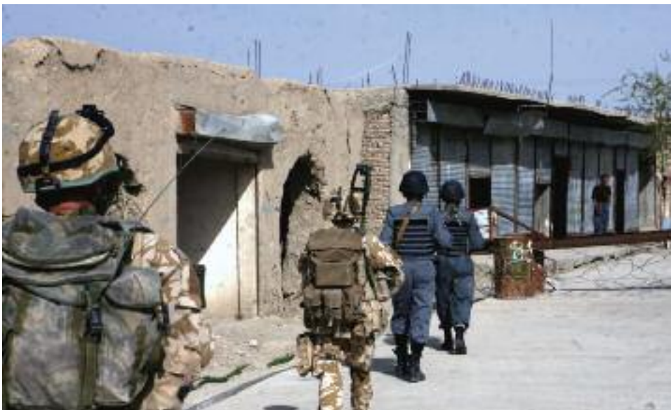
British troops patrol with the Afghan police in Musa Qala, Helmand Province.