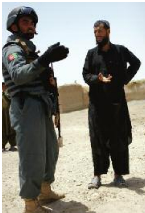
An Afghan policeman speaks with a village elder during a security patrol in Garmsir District, August 2009.

Over the course of the summer and into the fall, the platoon detected signs