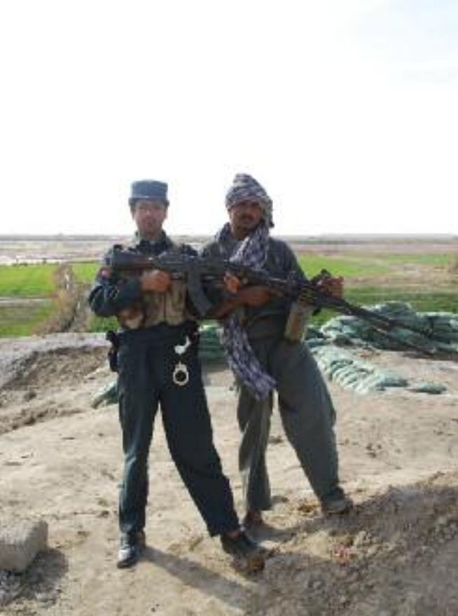
Afghan National Police and village guard at a checkpoint in Garmsir District, 2011.

effect on future interventions,” 83 and according to U.S. Defense Secretary Robert M. Gates, “[t]he odds of repeating another Afghanistan or Iraq—invading, pacifying, and administering a large third-world country—may be low.” 84 Acting early to prevent what Gates terms “festering problems” from spinning out of control will obviate the need for large-scale military intervention later, in his view. 85 Building the capacity of local police—and, in some circumstances, the capacity of irregular, tribal, and informal policing structures—has an obvious role to play in a preventative approach to violent sub-national conflict.