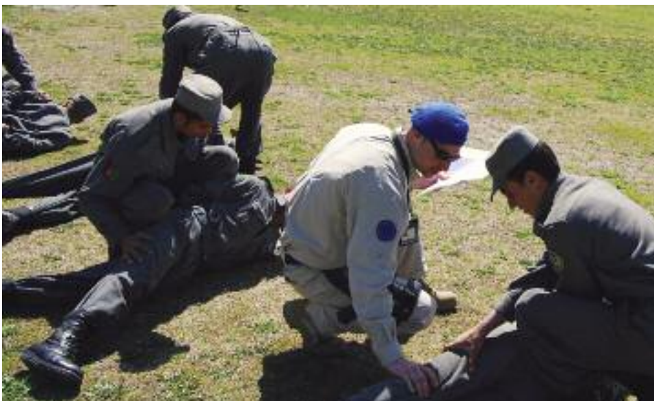
A European Union Police Mission in Afghanistan officer mentors the Afghan National Police.

The more fundamental issue was one of policing philosophy. These different views were irreconcilable. In the colonel's judgment, the ANP needed paramilitary rather than law enforcement training. "Afghanistan needed a force that could provide security," he remarked. "It was like the Wild West in the 1860s, and the police needed combat skills to survive."