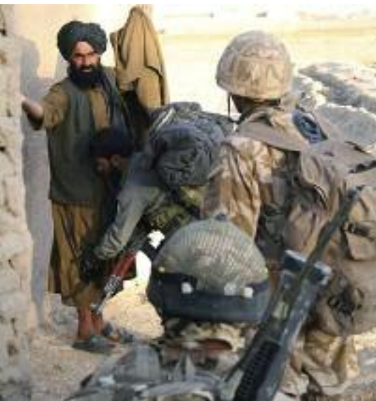
Members of the Royal Gurkha Regiment look on as an Afghan policeman searches a resident in Musa Qala District.

"It is hard to motivate the police," said one Gurkha officer. "Training them is not the hard part; teaching them discipline and determination is." 31