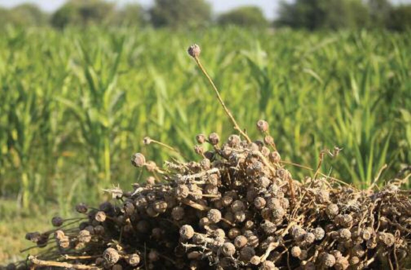
Dried poppy in Nawa-I-Barakzayl District