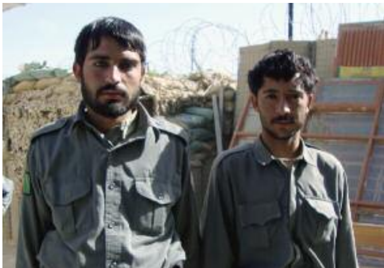
ANP officers in the Musa Qala District.

The Gurkhas within the police mentoring teams displayed an ingrained talent for working with the Afghans. Recruited in Nepal and renowned for their professionalism, prowess, and tenacity, Gurkhas shared linguistic as well as cultural affinities with the Afghans. At a