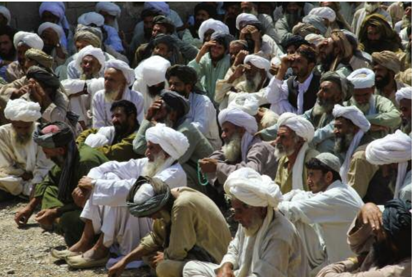
A Tribal shura in Helmand Province in July 2009.