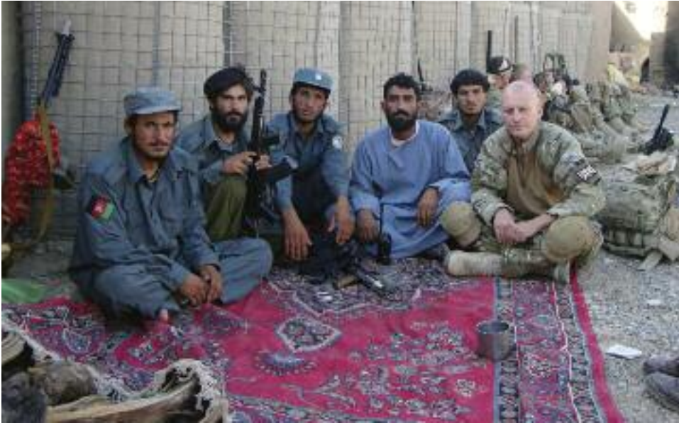
Afghan police at a checkpoint with a British advisor in Sangin.

The lieutenant colonel was skeptical about the program at first. He knew of at least one case where members of local defense forces were not being paid and were accountable only to the village elders. “The last thing you needed was a group of armed civilians running around,” the UK advisor said. “There were tribal disputes daily, and it was very easy for them to escalate. Without salaries they would have to steal from the very community they were supposed to be protecting.” In one village in Helmand, U.S. commanders were convinced that the village defense force should be given uniforms, receive a salary, and become a part of the ANP. “They became accountable,” he stated, adding that becoming part of the country’s formal security structure “gave them tremendous pride.”