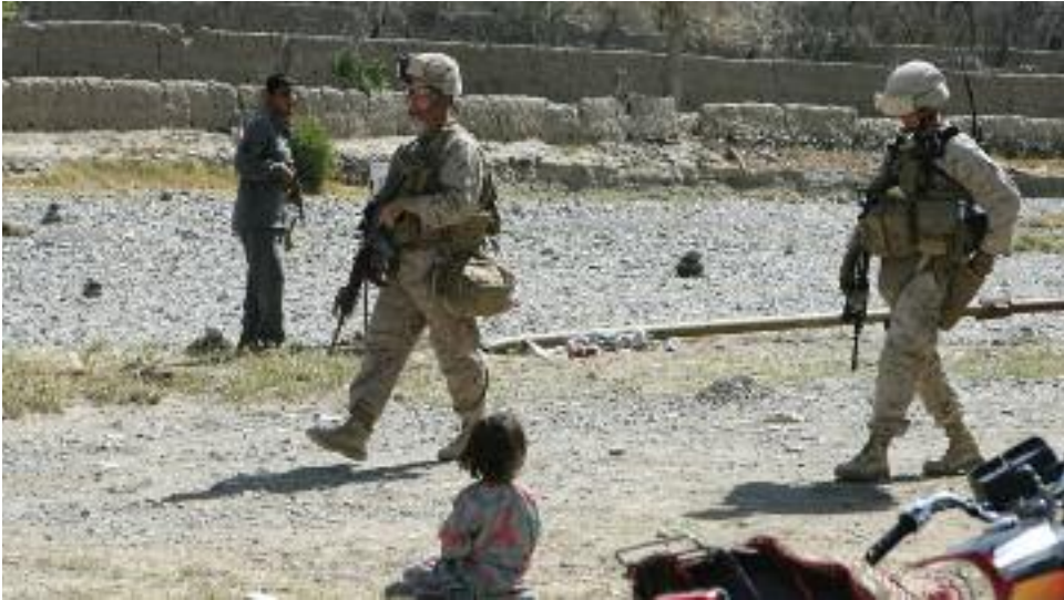
U.S. Marines and an Afghan National Police officer on patrol in the Now Zad bazaar.

ple, the PMT appealed to the Afghans' self-image as a culture of warriors: "I'd say to them, 'We hear back in the States that you're fierce warriors, but I'm not seeing it.'" The PMT pressed the police to take responsibility for planning and conducting their own operations, but with limited success. "We didn't go outside the wire without the ANP," the Marine said. "We pushed them to plan cordon-and-knock operations and raids. We'd tell them, 'You have information, this is your country, you're the police. What are you going to do about it?'"