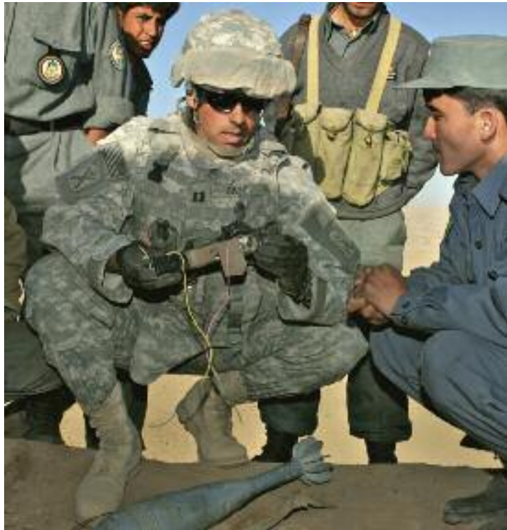
A U.S. Army mentor and an Afghan police officer examine an improvised explosive device during an operation in Faryab Province, November 2007.

This complex array of international police advisors created challenges for the advisor. "I probably spent more time working with the Coalition than with the ANP," the colonel recalled. With PRTs, EUPOL, and the Germans pursuing different and sometimes competing agendas, he attempted to synchronize the multinational effort. "I'd meet once a week with the German provost marshals," he said. Some issues involved the lack of resources—the Swedish PRT, for example, was chronically underfunded, and so had difficulty carrying out effective mentoring.