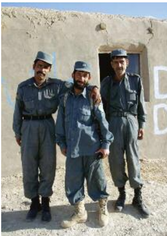
Police Mentoring Team Swampfox was responsible for about 115 to 200 police officers in the Qalat District.

Chronically short of vehicles and fuel, the ANP used checkpoints as a means to monitor and control traffic flow along major roads. In theory, checkpoints, as population-control instruments, contributed to law enforcement and counterinsurgency. In practice, checkpoints were more often sources of income for the ANP, who used them to extract goods and revenue from vehicles and their passengers. Such predation helped reinforce the public’s perception of the police as a corrupt and sinister force—a perception obviously inimical to the population-centric counterinsurgency strategy advanced by U.S. and Coalition leaders.