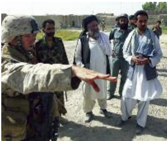
A U.S. Marine meets with local notables in Nawa District.

In August 2009, the provincial police chief sent a group of 50 Afghan policemen from Lashkar Gah, the provincial capital, to Nawa, ostensibly to provide security for upcoming presidential elections. The sergeant suspected that the real reason they were sent was to improve the public's perception of the ANP. The Nawa District police chief had neglected his own men, and he had also ignored the security concerns of district residents. "It was a 'hearts and minds' effort," said the Marine.