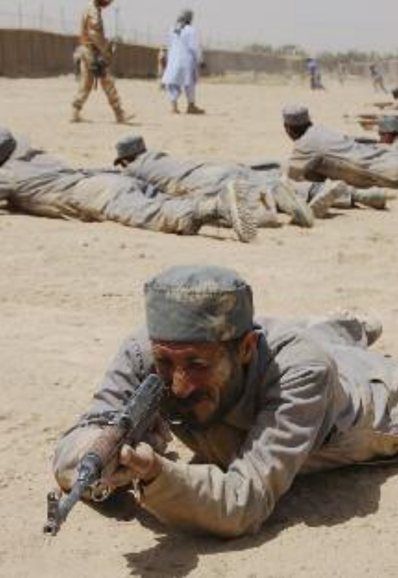
An Afghan policeman at the regional training center in Kandahar.

While the ANP was away, the citizens of Garmsir grew weary of ANCOP's paramilitary approach, confirming the platoon commander's belief that what the district needed was community-oriented policing. "They needed a sheriff, not riot control cops," he stated. So, despite the ANP's soiled reputation, district residents welcomed the return of the police. "They held a welcome-home parade for the ANP," he recalled.