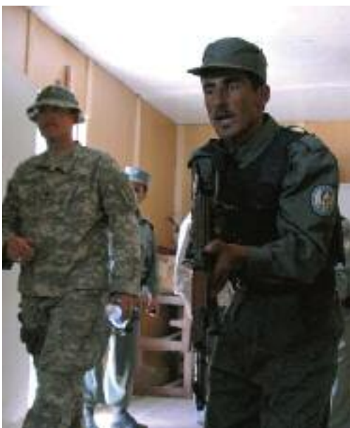
SWAT training in Kabul, 2007.

ANCOP officers typically met their mentors’ expectations. “They did very, very well,” stated the PMT leader. Particularly notable was the relative lack of corruption—a significant and enduring problem throughout the ANP.