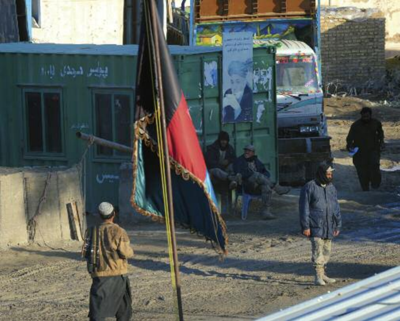
A border crossing in Kandahar Province.

During his four months of mentoring the ABP, he detected signs of progress. The BDD program was a step forward in his view. Before the initiative, border police “were just given a t-shirt and an AK-47 and told to man a post,” he said. “Now, there is a vetted, trained force, and I think we were starting to get ‘buy-in’ from the ABP.” This training, in his judgment, gave the ABP a better sense of unit cohesion and a greater ability to survive violent encounters with the Taliban.