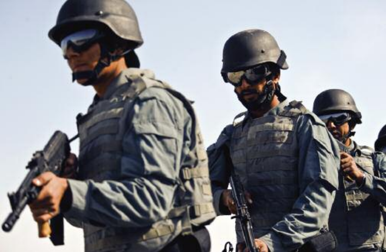
Afghan police at the Helmand police training center in Lashkar Gah in January 2010.

Training for the police grew more rigorous and systematic over the course of the summer. Previously, Afghan policemen “had simply been given a gun and told to go to a checkpoint,” the British advisor recalled. The ANP in selected districts, under the Focused District Development program, were now being sent to training facilities, where they were screened for drug use, re-equipped, and given instruction in basic skills. “Now they had to meet pass-out requirements, and only at that stage could they go to checkpoints,” he noted.