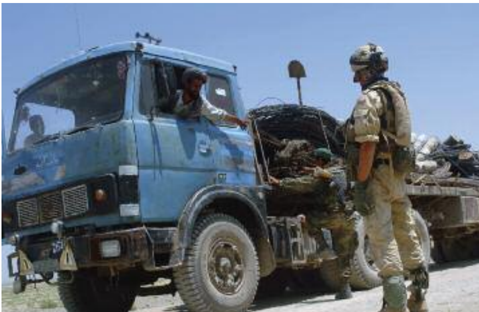
A vehicle search at a checkpoint in Ghazni Province, 2007.

ern Tajiks. 43 Operation Enduring Freedom and the collapse of the Taliban regime created new opportunities for the Hazaras, who saw cooperation with the Americans and their Coalition partners as an avenue out of isolation and oppression.