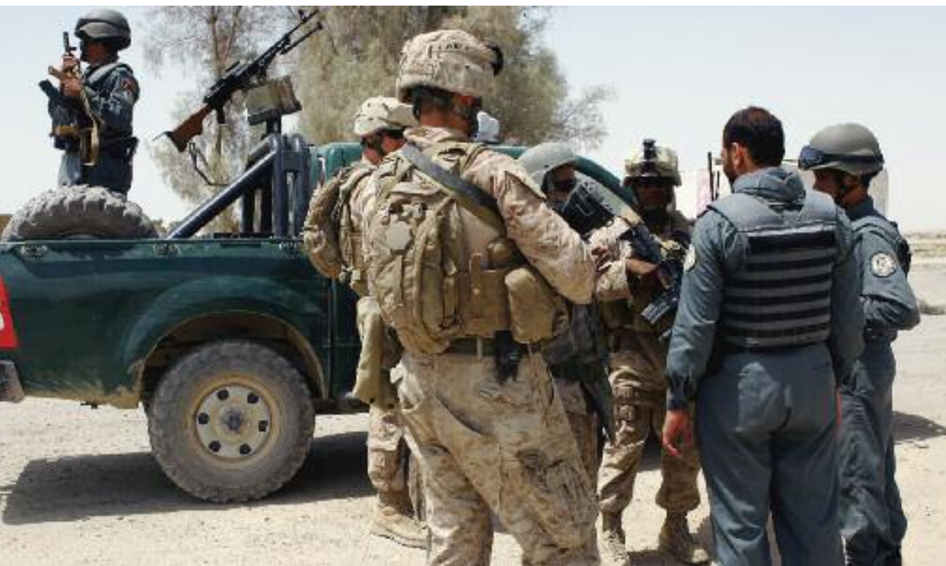
Marines prepare to patrol with the ANP in Garmsir District, August 2009.

Still, the police at checkpoints required careful monitoring and supervision. In addition to engaging in unprofessional behavior, such as napping on duty and taking drugs, the ANP used the checkpoints as platforms for extracting unofficial "tolls" and robbing vehicles and their passengers. Routine visits from the mentors were meant to deter crime