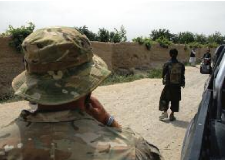
A U.S. soldier supervises a checkpoint run by a local defense force in Kandahar Province in April 2010.

Afghanistan was frowned upon by some Americans, and his initiative had an unfavorable reception. Today, building local self-defense forces remains controversial; however, it now has powerful advocates in the upper reaches of the U.S. military command who are eager to generate additional Afghan forces as quickly as possible.