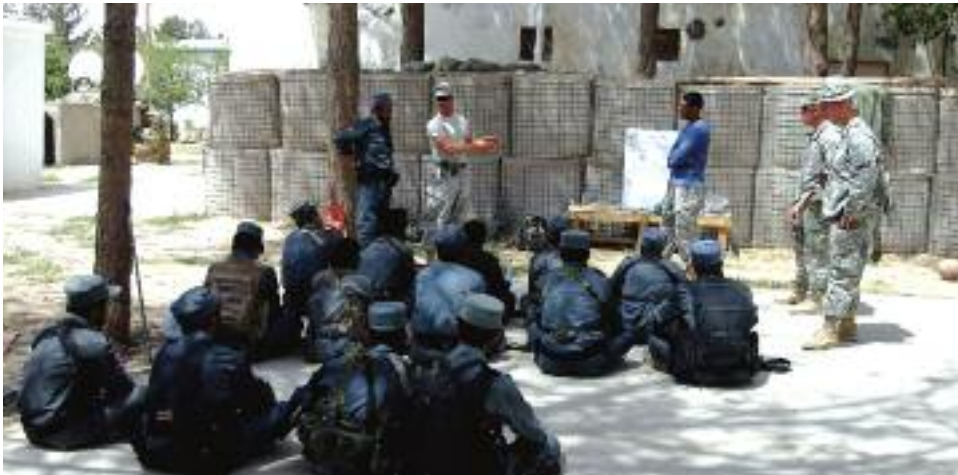
The Swampfox team mentoring included classroom training, but the police lacked patience to sit through such formal instruction.

Moreover, isolated and poorly defended checkpoints were highly vulnerable to insurgent attacks, and, given the ANP's lack of mobility, it was almost certain that reinforcements would be slow to arrive.